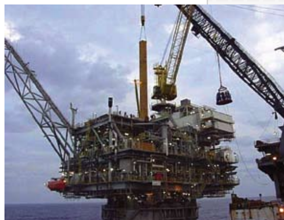
A buoyancy can (9.5' in diameter x 180' long) coated with the TSA Corrosion Protection System craned into a spar platform. The production riser and keel piping also were coated with the TSA Corrosion Protection System.