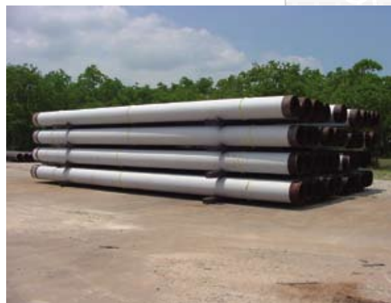
The TSA Corrosion Protection System functions as the sole source of corrosion protection for subsea piping.