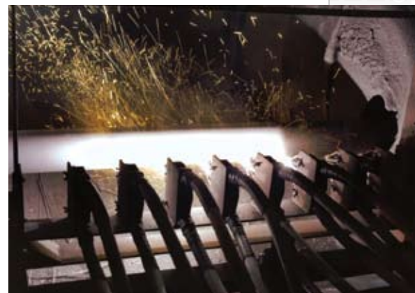
Praxair has developed an automated process for applying the TSA Corrosion Protection System to piping up to 75 feet long

The TSA Corrosion Protection System can be applied both manually and by an automated process specifically designed for straight-run pipe in sizes from 3 to 39 inches in diameter. Length capability for automated metallizing of piping is 25 to 75 feet. Internal diameter (I.D.) of piping can also be coated.