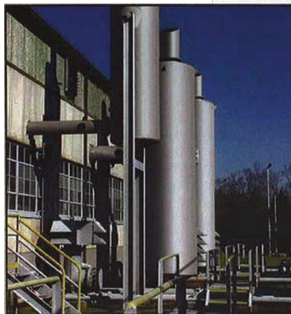
High-temperature compressor mufflers operating at temperatures up to 900°F (482°C), coated with the TSA Corrosion Protection System