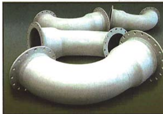
Fabricated pipe spools from a petrochemical facility, coated with the TSA Corrosion Protection System to provide atmospheric corrosion control