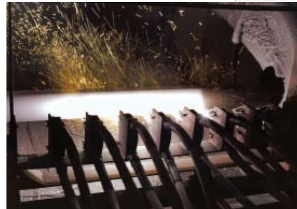
Praxair has developed an automated process for applying the TSA Corrosion Protection System to piping up to 75 feet long

The TSA Corrosion Protection System can be applied both manually and by an automated process specifically designed for straight-run pipe in sizes from 3 to 39 inches in diameter. Length capability for automated metallizing of piping is 25 to 75 feet. Internal diameter (I.D.) of piping can also be coated.