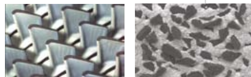
Figure 3. Gas turbine blades coated with Tribomet abrasive tip coating; magnified top view of Tribomet TBT406 coating