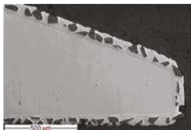
Figure 2. Cross section of Tribomet TBT406 coating

Tribomet abrasive coatings are applied to rotating parts of gas turbine engines such as turbine and compressor blade tips and labyrinth seals. If contact between a stator and a rotor occurs, interactions between the abrasive and abradable counterface coatings can cut a machined gas path seal and also prevent the generation of thermally induced cracking of the rotor as a result of friction heating. This enables a design that reduces the gap between stator-rotor assemblies to improve fuel efficiency.