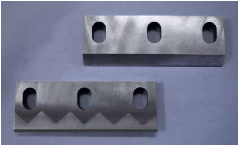
Regrind knives used in plastics recycling

This same procedure can save other wear-sensitive equipment used in plastics processing.